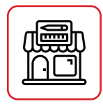
Raw Material Stores