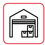
Warehouse & Dispatching