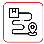
Track & Trace