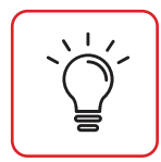
Pick to Light